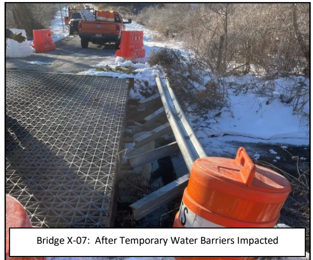
Bridge X-07: After Temporary Water Barriers Impacted

For more information about this project please feel free to contact the Sussex County Division of Engineering at 973-579-0430 or by email at dpw@sussex.nj.us .