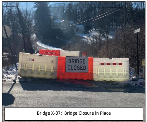
Bridge X-07: Bridge Closure in Place